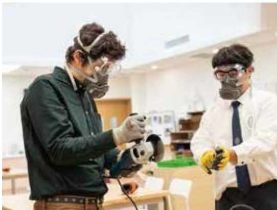
STEAM and DT Centre