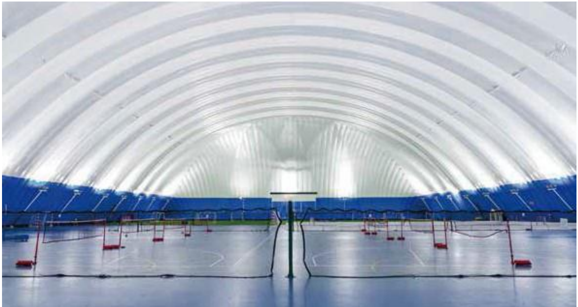
10000 m 2 Air-Conditioned and Filtered Sports Dome