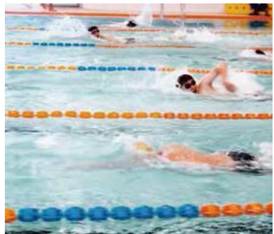
Water Sports Centre