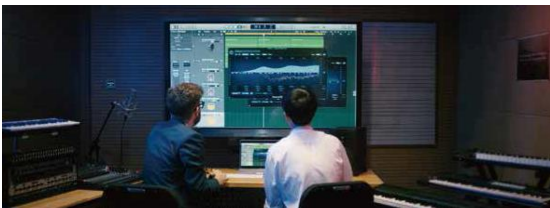
Music Studio Complex